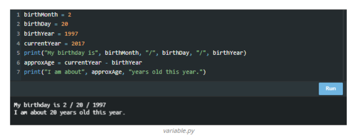
Figure 3 Coding Snippets

5. Have fun practicing this snippet as many times as you like - there are no limits!