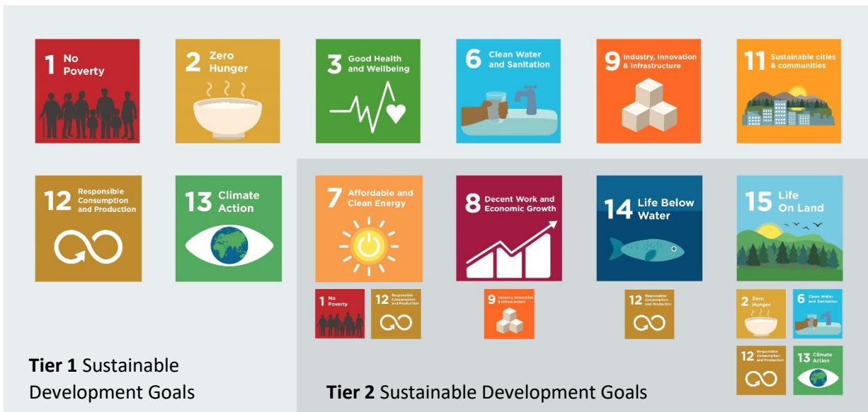
Figure 3 – Generalised framework linking outcomes gathered from the knowledge system (e.g. international survey, evidence review and stakeholder workshop) with the ecosystem services delivered by freshwaters (based on Wood et al.