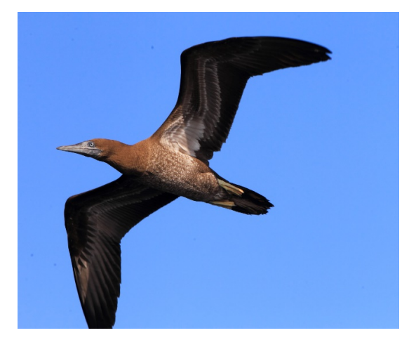
Fig. 6 Brown Boobies (Sula leucogaster).

With regard to seabirds, we noted a colony of >200 individuals of Brown Boobies nesting in rocky cliffs at the southernmost point of the island (Fig. 6). This represents the largest colony of Brown Boobies in the archipelago. Angehr et al. (2004) reported a colony of 120 Brown Boobies and 80 Brown Pelicans nesting at this site, as well as a nesting colony of 28 Brown Boobies on Uva Island in the Contreras Islands in the northern part of CNP.