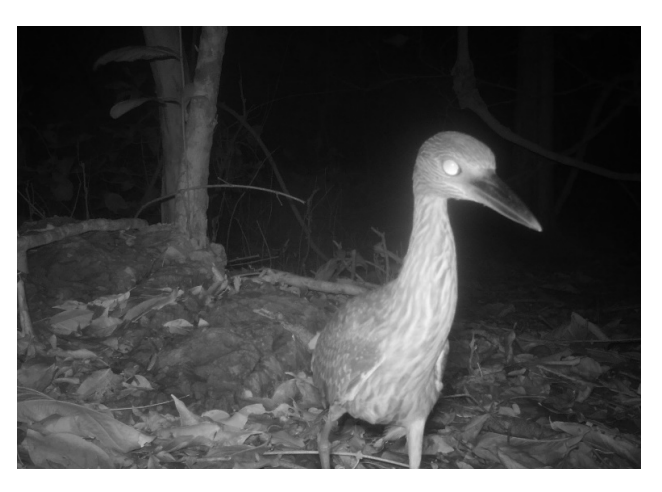
Fig. 4 Yellow-crowned Night-Heron (Nyctanassa violacea).

Yellow-crowned Night-Heron ( Nyctanassa violacea Linnaeus, 1758): the only record of this species was taken by a camera trap in Punta Ursula of Jicarón Island. The photographed individual was an immature (Fig. 4) and represents the southernmost record for this species in Panama. This species was first recorded by first Wetmore (1957) in Coiba Island and recent reports are uncommon.