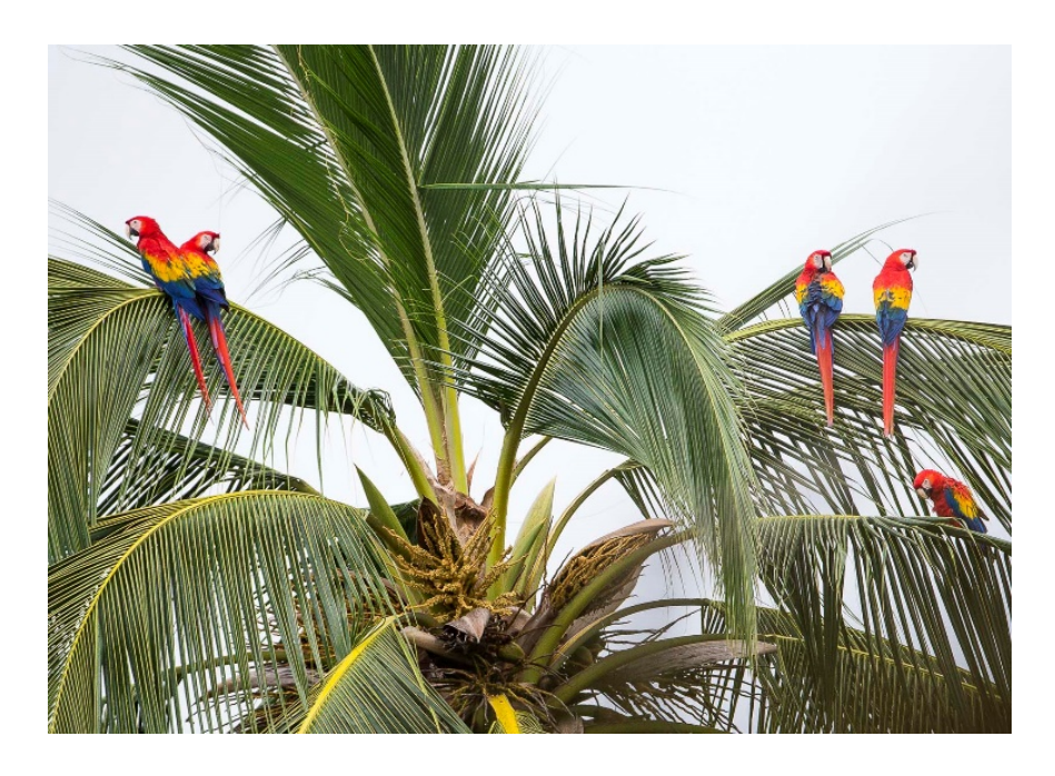
Fig. 2 Scarlet Macaw (Ara macao).

Wandering Tattler ( Tringa incana Gmelin, 1789): this small shorebird is a rare transient, with few sightings in Panama, most records being from the Frijoles islets off the north coast of Coiba (i.e. eBird: checklist S27159064 by Groenendijk, 2016). We observed a single individual along the rocky shore in the northwest section of Jicaron.