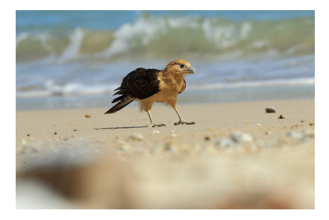
Fig. 5 Yellow-headed Caracara ( Milvago chimachima ).

Yellow-headed Caracara ( Milvago chimachima Vieillot, 1816): this species was first recorded on Coiba in 1993 and since 2001 has become common throughout the island (G.R.A. pers. obsn.). In the past 30 years, the species has undergone a remarkable range extension throughout Panama (Fig. 5)