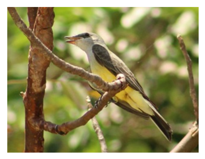
Fig. 3 Western Kingbird (Tyrannus verticalis).

Yellow-crowned Night-Heron ( Nyctanassa violacea Linnaeus, 1758): the only record of this species was taken by a camera trap in Punta Ursula of Jicarón Island. The photographed individual was an immature (Fig. 4) and represents the southernmost record for this species in Panama. This species was first recorded by first Wetmore (1957) in Coiba Island and recent reports are uncommon.