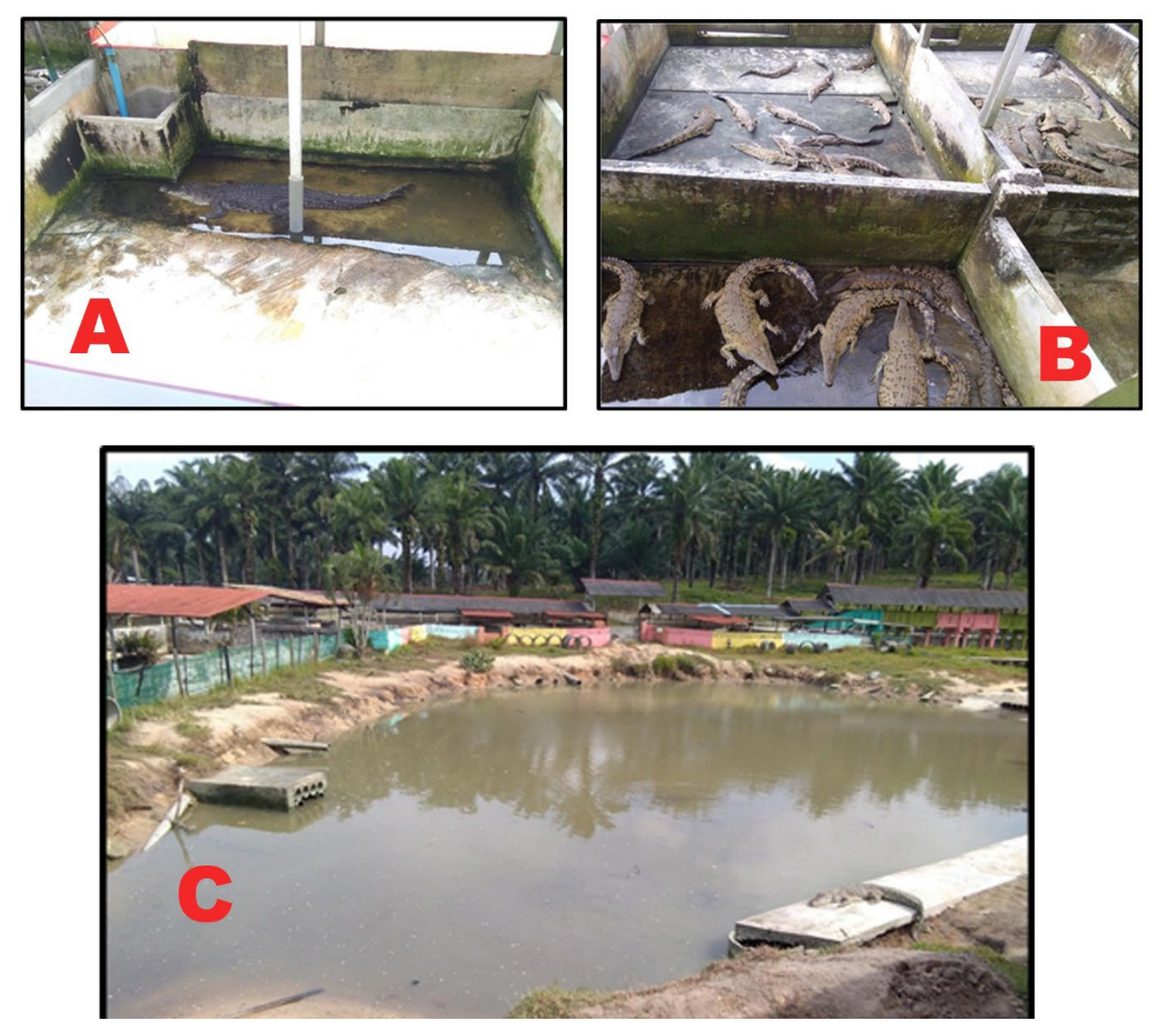
Fig. 2 - (a) individual enclosure; (b) small enclosure; (c) breeding enclosure inside Teluk Sengat Crocodile Farm