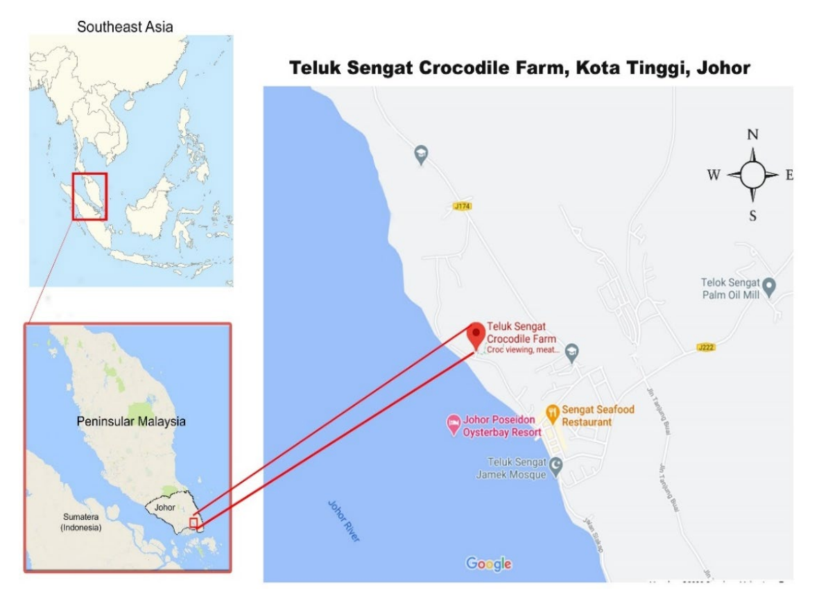
Fig. 1 - Location of Teluk Sengat Crocodile Farm, Kota Tinggi, Johor

This study was carried out in Teluk Sengat Crocodile Farm (1.5651066^{\circ}N, 104.0241387^{\circ}E) in Kota Tinggi, Johor (Fig. 1). There are eight breeding enclosures, 37 small enclosures and 37 individual enclosures (Fig. 2) where the crocodile were kept in captivity. However, only six breeding enclosure, 27 small enclosure and 37 individual enclosure were open to public. The other two breeding enclosure and ten small enclosure were restricted only for management purposes. There are estimated around 1000 individuals of saltwater crocodile in this facility. This study was carried out simultaneously with agnostic behaviour of captive C. porosus in captivity that is available in this volume as well.