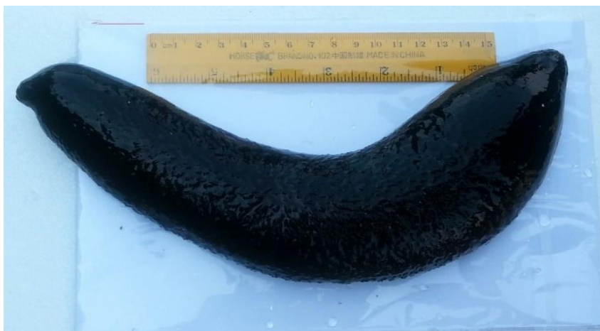
Fig. 1 - Specimen of Holothuria ( Mertensiothuria ) leucospilota collected from Giam Island, Pangkor Island, Perak (labelled as HL)

Two specimens of H. leucospilota were collected from Giam Island (4° 14' 09.5" N 100° 32' 22.4" E) and Teluk Nipah Beach (4° 14' 03.3" N 100° 32' 41.4" E) in Pangkor Island, Perak as sources for fungi and yeasts samples. The specimens were labeled as HL (Fig. 1) and HL1 (Fig. 2). Non-protein-coding 12S and 16S mitochondrial ribosomal RNA (rRNA) gene sequences of the HL1 specimen (Fig. 2) were registered with the GenBank, National Center for Biotechnology Information (NCBI), U.S. National Library of Medicine (Accession No.: KX768273 - KX768274). Both specimens were then subjected to the microbial isolation procedures immediately after the collection. The isolation media were placed in iceboxes during transportation to keep them in cold condition.