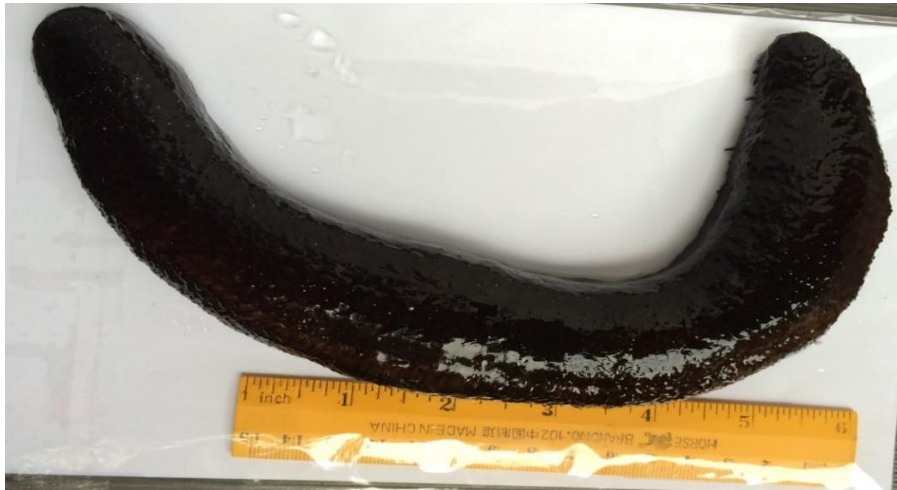
Fig. 2 - Specimen of Holothuria (Mertensiothuria) leucospilota collected from Teluk Nipah Beach, Pangkor Island, Perak (labeled as HL1)