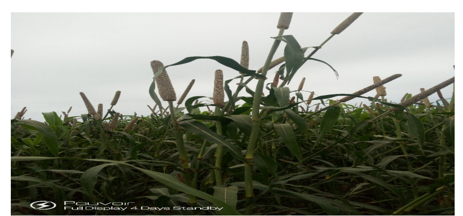
Fig. 1 - Pearl Millet bunch growing on farms in northern Nigeria.

Pearl millet exhibits a tremendous amount of diversity at both phenotypic and genotypic levels (Abdulhakeem, et al , 2019). The International Crop Research Institute for the Semi-Arid Tropics (ICRISAT) collected 23,092 accessions of pearl millet germplasm originating from 52 countries, and it is the largest collection of pearl millet germplasm in the world (Upadhyaya, et al. , 2017) A total of 123 accessions were collected from three Pearl millet production regions of Ghana and concluded that there is wide phenotypic variation among landraces (Asungre, 2014). Northern Nigeria is also home to diverse varieties of pearl millet (Ogechi, 2014). For example, Angarawai, et al. (2016) collected 125 accessions of Nigerian Maiwa type of pearl millet. David et al. (2017) also reported 24 genetic diversity of Nigerian and Indian pearl millet accessions. However, other studies show the continuing concern over the extent of erosion of genetic diversity of the crop (Diamond 2002, Izge & Song 2013). Thus, a better understanding of, and support for, farmers' management of diversity is still needed, despite significant advances in this area.