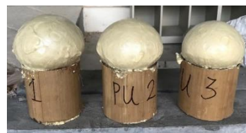
Fig. 3 - Bamboo specimens filled with Polyurethane Foams (PU)