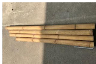
Fig. 1 - Bamboo Semantan

The type of bamboo to be used is Bamboo Semantan and scientific name is Gigantochloa scortechini . The age of the bamboo is around 3 to 5 years old. Figure 1 shows the Bamboo Semantan used in the test. Figure 2 shows the Glass Fiber Reinforced Polymer (GFRP) strengthen bamboo. GFRP is a composite consists of glass fiber either continuous or discontinuous and contained within a polymer matrix. The reasons of using this composite material is it has very high strength to weight ratio. Besides, it is light which it is only 10 to 20 kilograms per square metre. In addition, it able to mold complex shapes and it is durable. Figure 3 shows the bamboo specimens filled with Polyurethane Foams (PU). PU is one of the porous materials that are widely used in numerous applications for example cushioning, seating and sound package materials (Shuming Chen, 2016). The advantages of polyurethane foams are comfort to use, durability, resiliency, energy absorption and handling strength.