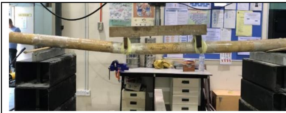
Fig. 4 - Shear failure at the point of loading at Specimen 2