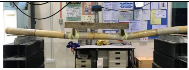
Fig. 5 - Shear failure at the point of loading at Specimen 3