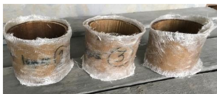
Fig. 2 - Bamboo specimens wrapped with Glass Fiber Reinforced Polymer (GFRP)