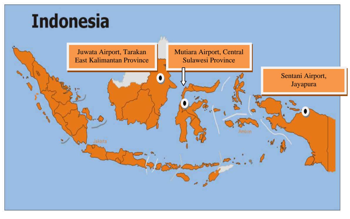
Figure 2. Map of Airport Location

Airport location surveyed consists of Sentani Airport, Jayapura, Papua Province; Mutiara Airport Palu, Central Sulawesi Province; and Juwata Airport, Tarakan, East Kalimantan Province. Detailed location and physical data can be seen in Figure 2 and Table 2.