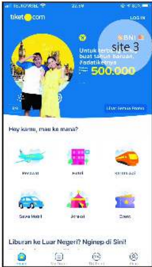
Fig 2. Object of research (Site 1, 2, and 3)