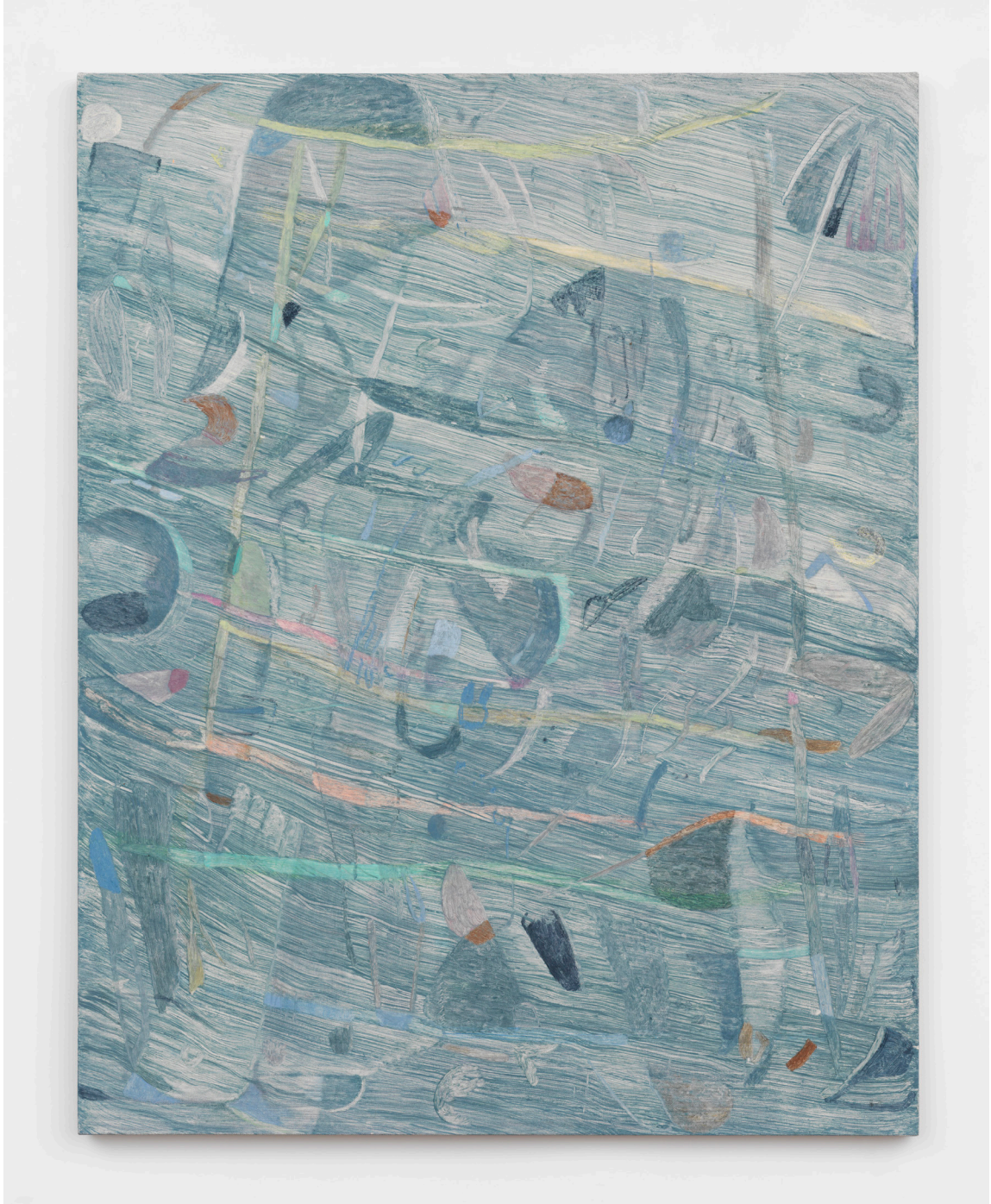
LEFT: Flush , 2017, oil on linen, 50" x 63" RIGHT: Drift , 2017, oil on linen, 53" x 42"