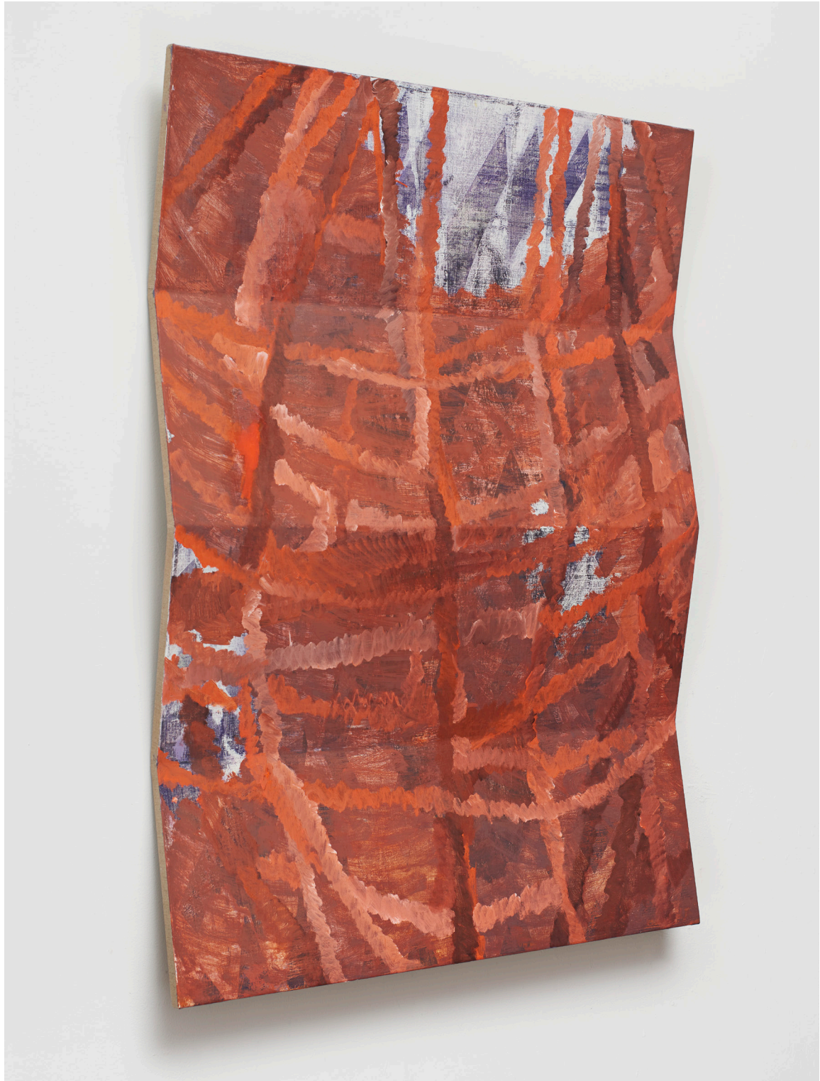
LEFT: A label, a background, a simulacrum , 2016 , oil on linen on shaped wood panel, 37" x 24" x 10" RIGHT: Hourglass Lake , 2016, oil on linen on shaped wood panel, 48" x 32" x 3.5"