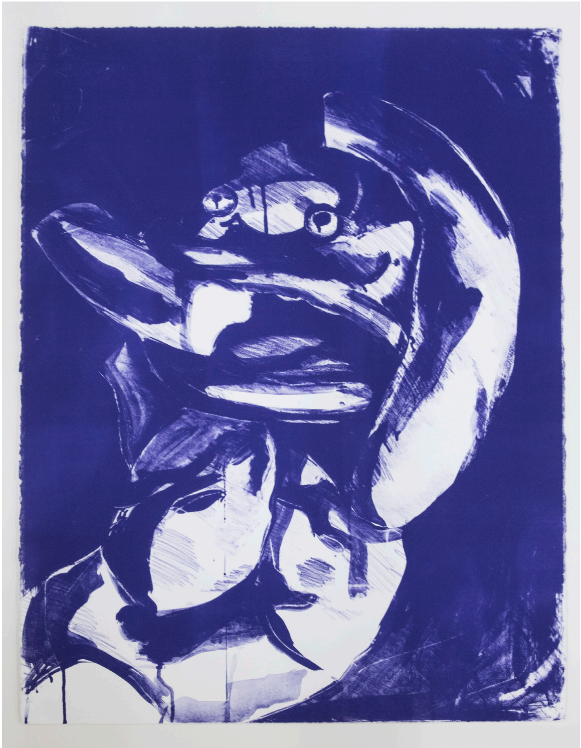
LEFT: The Architect's House , 2017, lithograph, 22" x 30" RIGHT: The Architect , 2017, lithograph, 30" x 22"