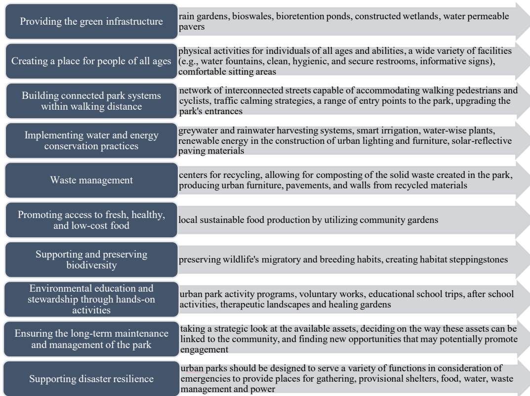
Figure 2. Ten Core Sustainable Design Objectives of Urban Parks.