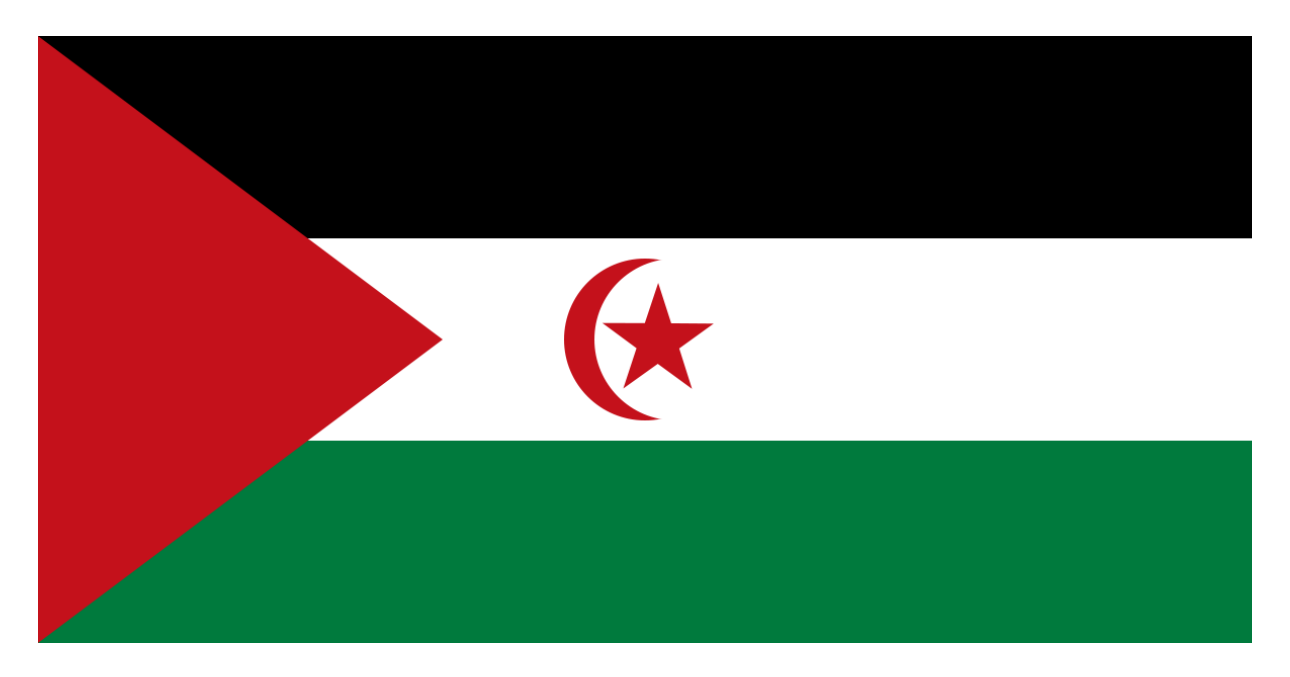
Figure 2: (SADR Flag, 2016)

In October 2010, Gdiem Izik occurred in the Western Sahara, which began as a few tents and later grew to over 25,000 protestors. The Gdiem Izik protests occurred prior to the larger Arab Spring uprisings in North Africa, and were located outside of the capital of the annexed Western Sahara, Laayoune (Wilson, 2013). Gdeim Izik protest focused on economic needs, but with emphasis on the marginalization of the Sahrawi population. Wilson's article also brings up the difficulty of statistics when it comes to the Sahrawi population, because they are so dispersed there are no exact population numbers attributed to either the Sahrawi's who live within the Moroccan-controlled borders or outside of them under the SADR. Wilson also discusses the Sahrawi strategy of protesting the annexation through living as refugees, this is their way of resisting Moroccan occupation (Wilson, 2013). A symbol of the Sahrawi resistance is the flag of the SADR, symbolizing the sovereignty of the state (Farah, 2010).