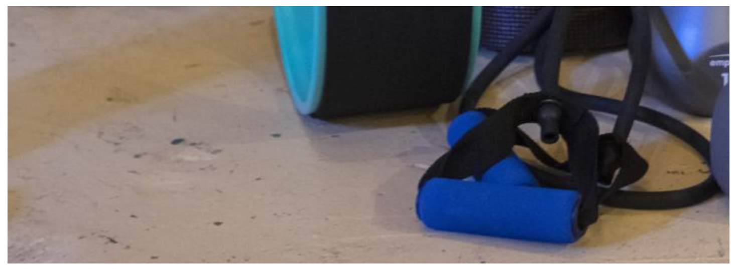
Jake NelsonHaving fitness equipment at home broadens the types of workouts you can do, but is not always nec-

If you don't want to search through YouTube and Instagram pages for workout inspiration or feel like you don't have adequate equipment to do so, improvise! No weights? No problem. Use anything you have access to, like a jug of water or even a wine bottle. For some of the most effective workouts, equipment is not necessary or is minimal at best. If space is an issue, stationary exercises are viable options. Worried about noise in an apartment with neighbors below you? No-noise, low-impact workouts await. The options are endless, and creativity is only increasing as more and more fitness gurus have been confined to the walls of their homes.