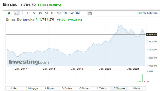
Figure 2. Gold Price Graph

Investment in precious metals / Gold is an investment instrument that has the least risk. Gold is also often traded in the commodity market, so gold is interesting to research. During 2020, the Covid-19 pandemic occurred which caused conditions of economic uncertainty, so that the gold price experienced a significant increase. This can be seen in the graph below: