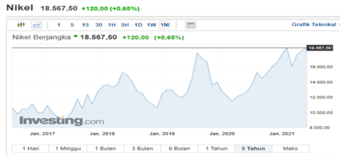
Figure 3. Nickel Graph