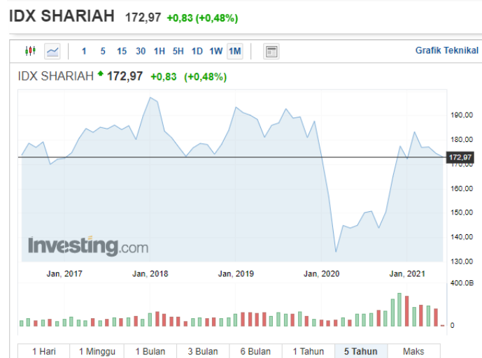
Figure 1. IDX Syariah Graph

which is equivalent to 12.7% of the Muslim population worldwide. With the largest Muslim population, the Indonesian stock exchange must provide investment facilities that are in accordance with Islamic teachings. So that the Indonesian Sharia Stock Index was formed in 2011. The index consists of all sharia shares listed on the Indonesia Stock Exchange. The development of Sharia IDX during 2020 can be seen in Figure 1.