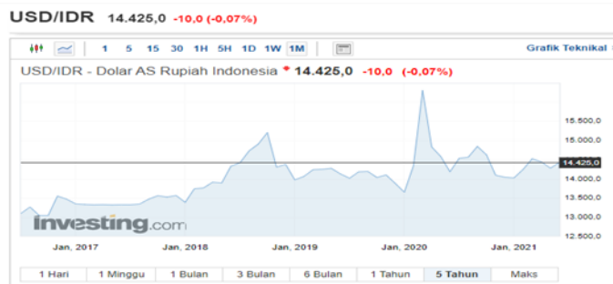
Figure 4. USD Exchange Rate Graph

In 2020 the USD exchange rate touched the highest figure, namely at Rp. 16,475/USD. This is due to the COVID-19 pandemic which causes economic uncertainty so that the demand for USD increases so that the rupiah exchange rate weakens. USD exchange rate fluctuations can be seen in the figure below: