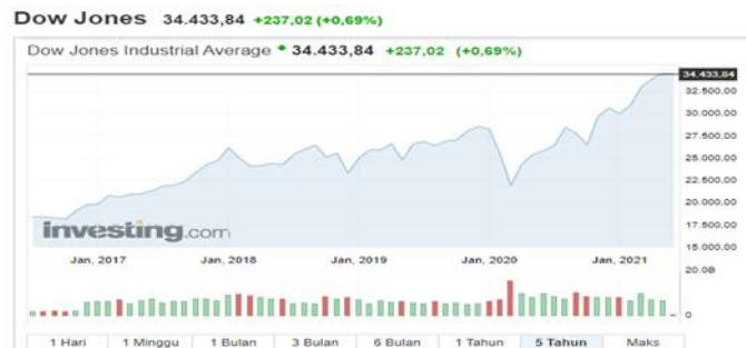
Figure 5. Dow Jones Graph

To predict stock price movements in Indonesia, investors generally use the Dow Jones Industrial Average. As a Muslim country in Southeast Asia, the FTSE Malaysia KLCI should also be considered for its influence on the Sharia Index in Indonesia.