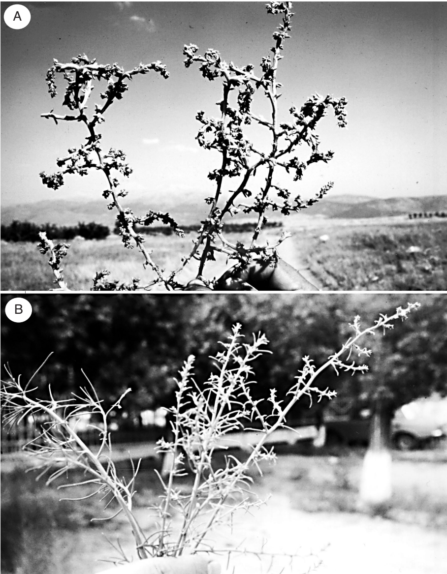
Fig. 3 - A) Salsola australis infested with A. salsolae (late in season - October 1995); B) S. australis infested with A. salsolae (early in season), one healthy branch on the left, four infested branches on the right of the photo (May 1996).