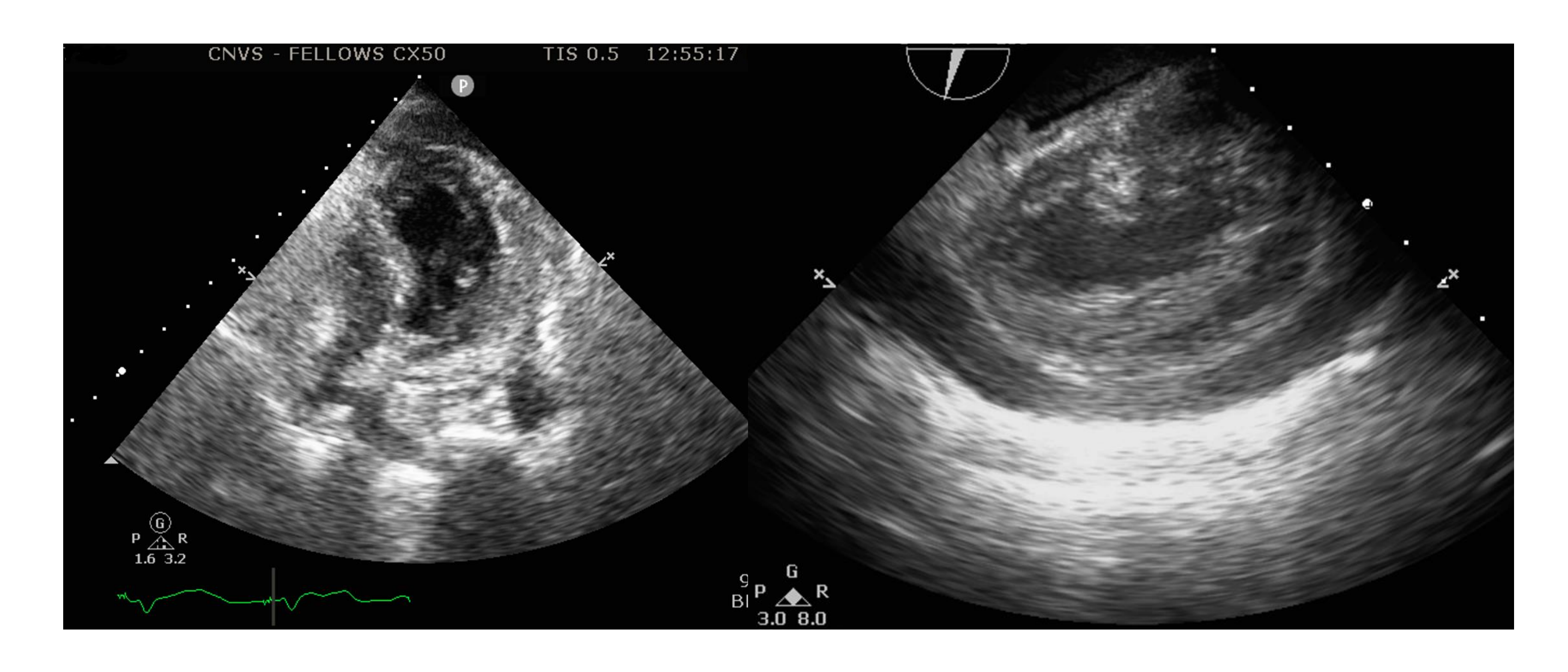
Figure 2. Echocardiography images of pericardial effusion