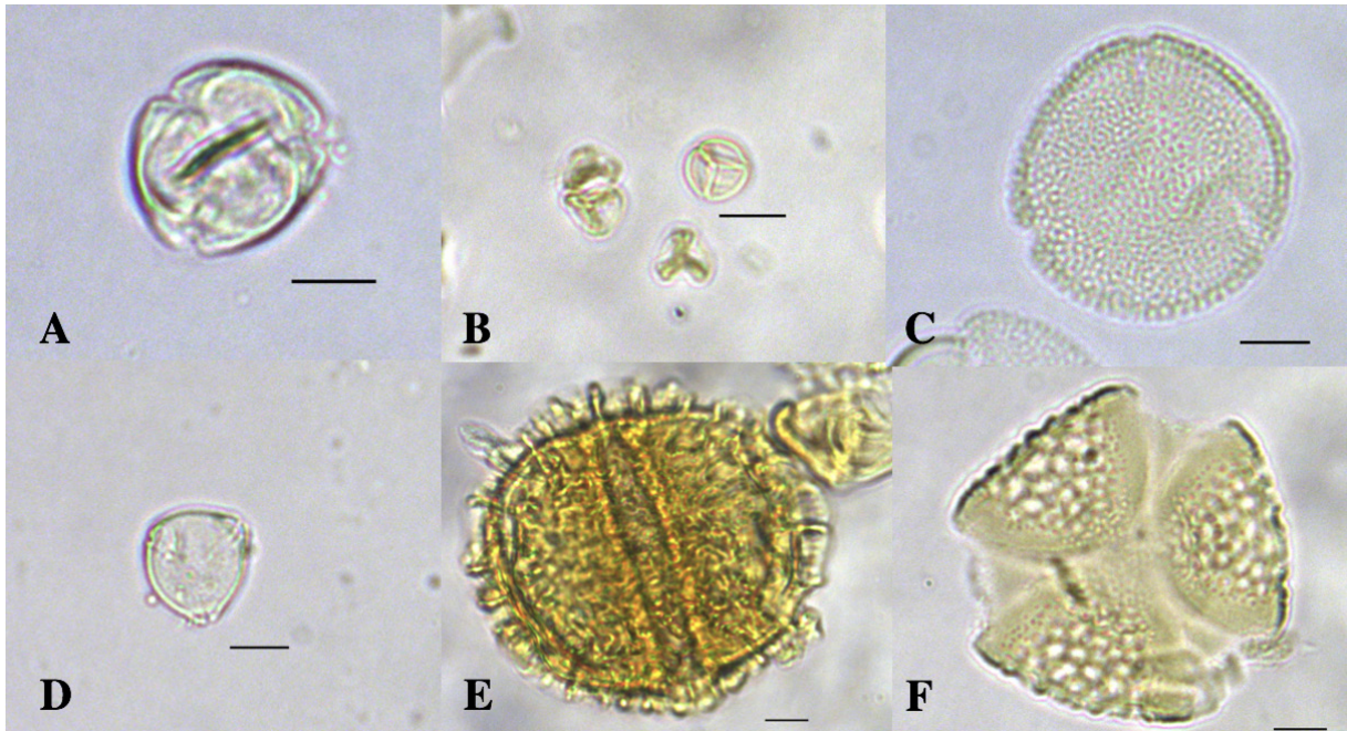
Fig 1. Photomicrographs of certain pollen types observed in the nests of Euglossa females. (A) Solanum , (B) Mimosa pudica , (C) Zanthoxylum , (D) Eugenia , (E) Dalechampia and (F) Centrosema brasilianum (scale bars = 10 \mu m).

The pollen type samples were ordered using PCA according to the similarity of their occurrence. Figure 2 shows that the variability covered 83.04% on the first two PCA axes, which demonstrates high similarity among the samples. Solanum , M. pudica , and Zanthoxylum were the principal components used for ranking the samples. The aggregate of