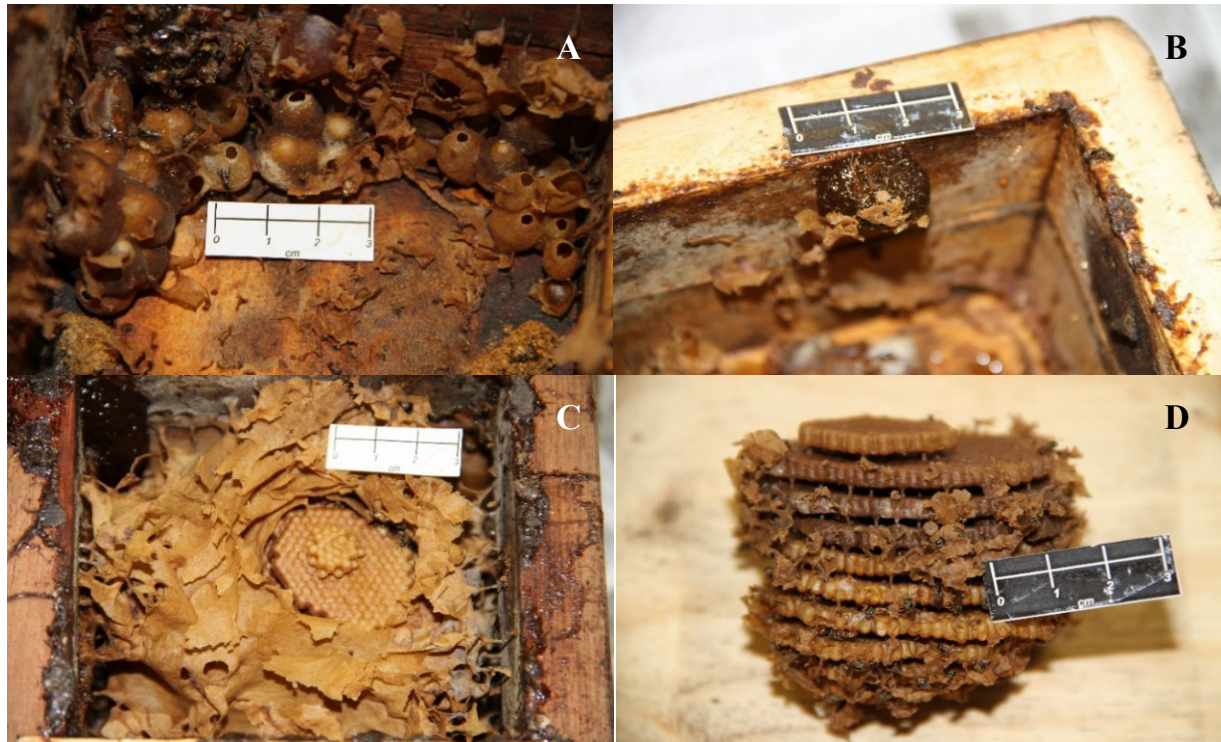
Fig 1. Nest architecture of the stingless bee Plebeia droryana . (A) Food pots (honey and pollen). (B) Resin pile. (C) The nest with all structures. (D) The amount of the combs (brood area). Scale bar 3 mm.

The characteristics of nest architecture in P. droryana were similar to those described by Zucchi and Sakagami (1972) and Wille and Michener (1973) in other species. We found the occurrence of an involucrum and the resin pile, typical of this species. In the brood area, the involucrum layers keep the temperature by retaining the heat production from brood metabolism (Wille, 1983; Engels et al., 1995; Barbosa et al., 2013). The presence of garbage dump deposit was observed in this study such as previously reported by Nogueira-Neto (1997) in other stingless bee species.