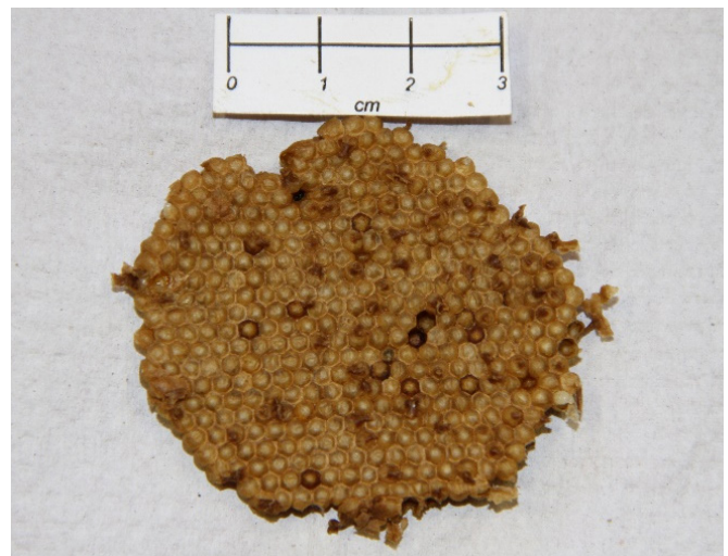
Fig 2. Brood comb of the Plebeia droryana used to estimate immatures. Scale bar = 3 cm.

Although some authors described previously the nest structures, the weight of them was not reported as in our study. The weight of the five colonies ranged from 987.7 to 1109.9g (Table 2). The brood combs weighted 31g in the PD1 colony, 44.1g in the PD2 colony, 38.3g in the PD3 colony,