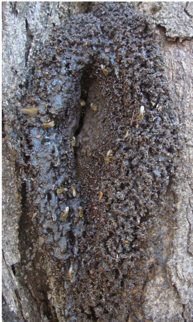
Fig 3. Nest entrance of Tetrasona clavipes .