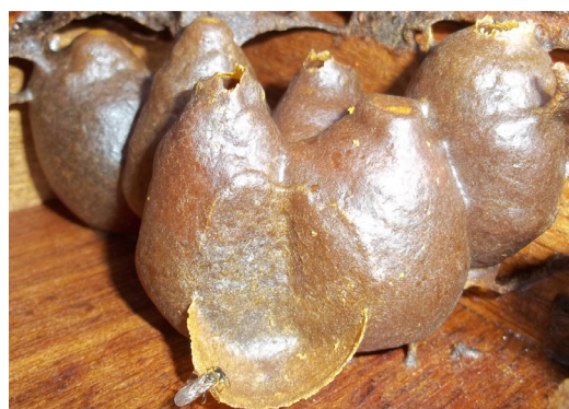
Fig 5. Honey pots of Tetrasona clavipes in a honey super.

For height and width of the oval shaped food pots (Fig 5), a statistically significant difference among colonies was found ( F_{(9,90)} = 3.79 ; P < 0.01 ; F_{(9,90)} = 4.21 ; P < 0.01 ). There was no clear segregation of honey and pollen pots in separate clusters. However, pollen pots were mainly near the brood, and there was apparently higher amount of honey pots than pollen. The bees built pots in widely dispersed locations, as the shapes of natural cavities were very irregular. The amount of honey was not measured due to food pot damage, and unwanted visitors, such as phorid flies ( Pseudohypocera sp. (Diptera, Phoridae)) rapidly appeared.