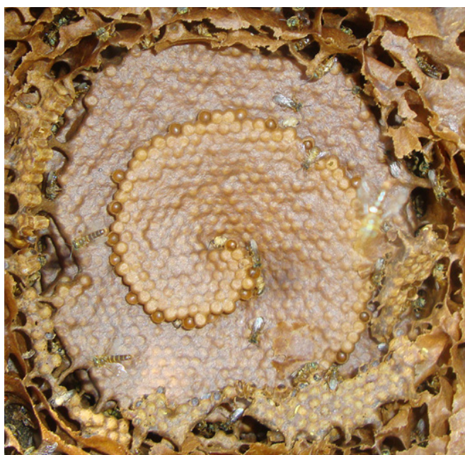
Fig 4. Superior view of the spiral brood combs of Tetrasona clavipes .

Regarding size, shape and distribution, there was a mean of 10.89 \pm 0.07 brood cells per \text{cm}^3 of brood. Therefore, the population of the 10 colonies was on average 50,920 \pm 20,100 individuals (Table 1). Royal cells were positioned at the edge of combs, and randomly distributed into the brood chamber, which had up to 17 cells per colony.