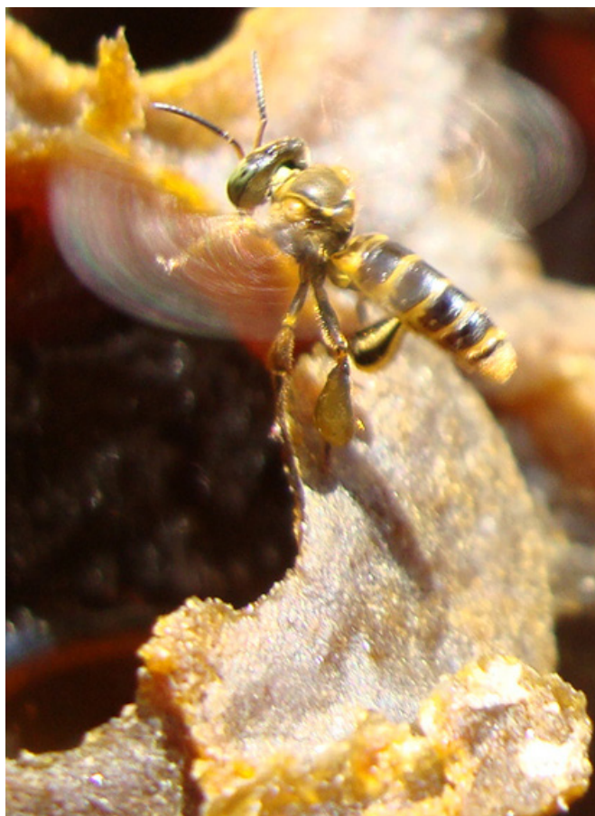
Fig 1. Worker of Tetragona clavipes taking flight.

gather information to be used on scaling a beehive adapted for raising this species.