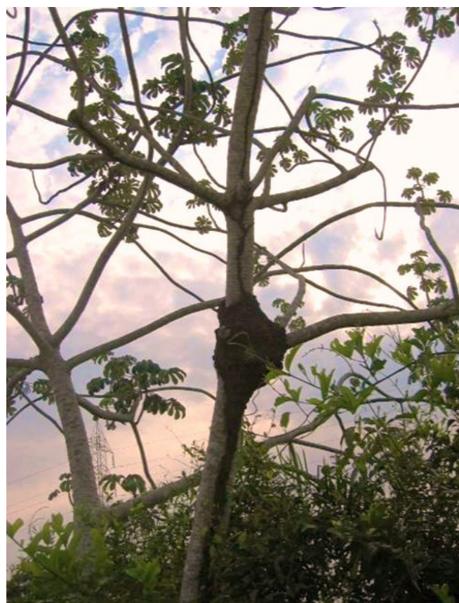
Fig 1: Cecropia pachystachya Trécul (Urticaceae) in South-Pantanal, Brazil, with a nest of Nasutitermes ephratae Rambur (Termitidae). Note the galleries spreading in trunk and branches.

Ants crossed the defined 10 cm 2 area in C. pachystachya individuals with and without termite nests, respective-