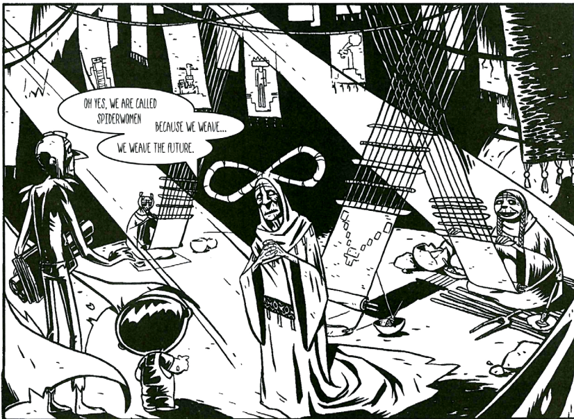
Figure 2: Pablo's Inferno .

of these mythical ghosts and ghostly monsters—such as La Llorona, the Cucuy, the nahuales—often originated in the encounter between colonizers and pre-Hispanic groups, and they can be considered as vessels disclosing “anxieties over identity by means of spectral haunting” (Ajuria Ibarra, Ghosting the Nation 134). Their enduring haunting revives conflicts and fears rooted in the past, constructing a “phantasmatic historical projection” (ibid. 135) that supports a postcolonial exploration of conflictual and unresolved identities. They are specters raising from a layered past, in which the pride in mestizo heritage clashes with the reproduction of inequality (Rozenal) and a fragmented, complex diaspora. Montijo’s intertextual play exploits several references to the uncanny that is pervasive in Mexican folktale. In book #4, for example, Pablo and Quetzal visit the Spiderwomen, a Mexican instance of the motif represented by the Fates, here described as three old Indigenous women weaving the future (Figure 2). Once again, the gothic mode surfaces in their reference to the lost past as “the thread that binds together the fabric of all existence” (#4 19).