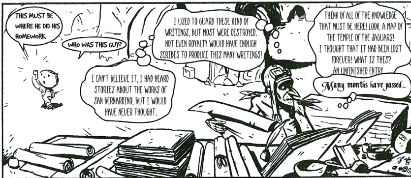
Figure 1. Pablo's Inferno

Source: Montijo. Pablo's Inferno . Issue 3, 2000, p. 20. © 2000 Abismo – Montijo.