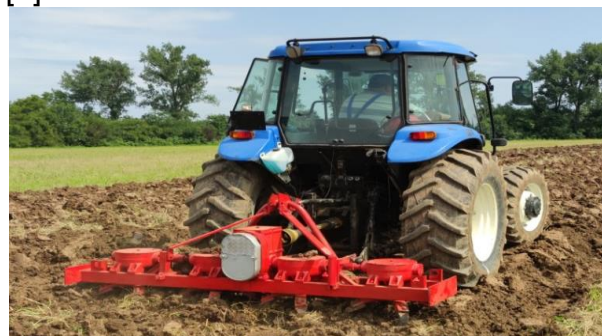
FIG. 1 TGARV UNIT IN OPERATION

vertical axis in aggregate with tractor of 80 HP and environmental conditions (soil, air, etc.) from the date of the experiments [7].