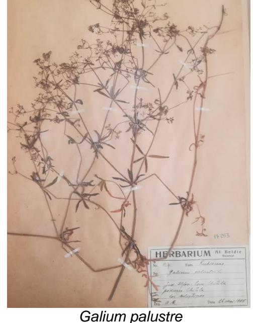
Fig. 2. Vouchers with plants from Ilfov County present in "Alexandru Beldie" Herbarium, "Marin Drăcea" National Institute for Research and Development in Forestry (Bromus japonicus – left, Galium palustre – right)

Genus Ranunculus comprises about 600 herbaceous species with a very large world distribution. The genus occupies varoius habitats, ranging from semideserts to temperate forests grassland, from mountain rain forests to anthropogenic habitats (Tamura, 1995 in Emadzade, Hörandl and 2012). "Alexandru Beldie" Herbarium there are 15 samples of 7 different Ranunculus species from Ilfov County such as: Ranunculus auricomus L., Ranunculus cassubicus Ranunculus constantinopolitanus, Ranunculus