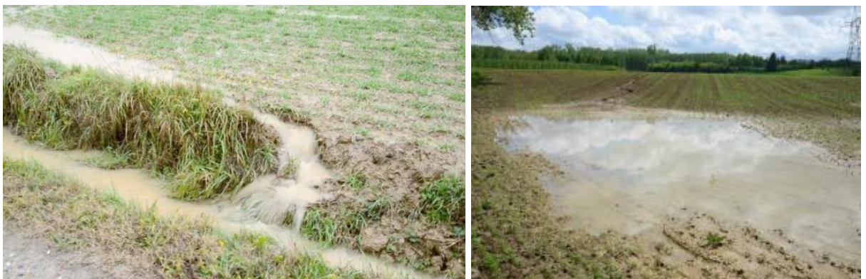
Fig. 2. Manifestation of the puddle phenomenon [12]