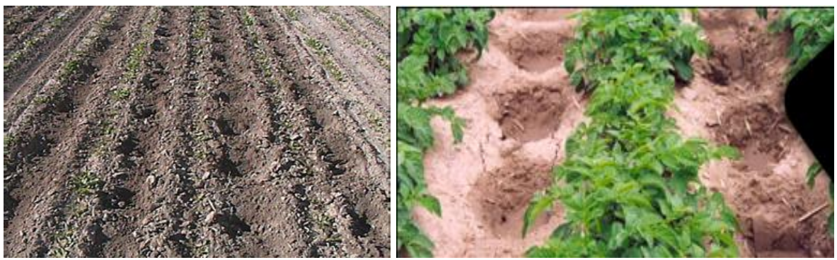
Fig.5. Storage tanks formed using Dammer Diker equipment [15]