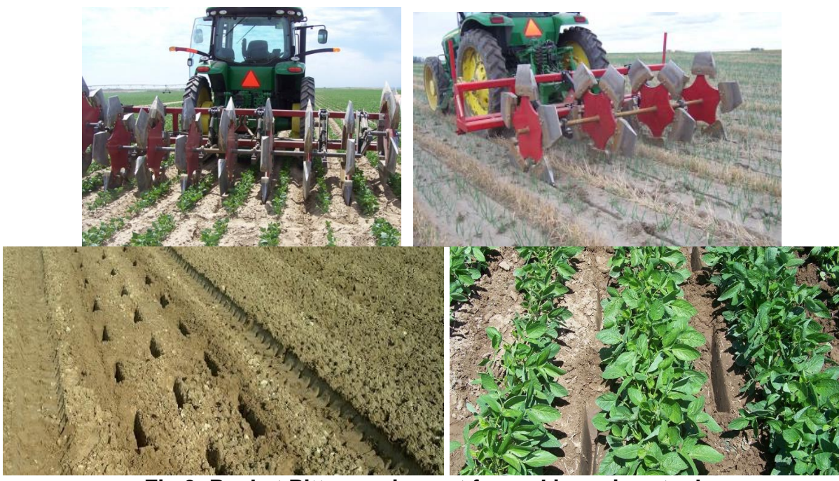
Fig.3. Pocket Pitter equipment for making micro-tanks in narrow-row cultures [11]

Analele Universității din Craiova, seria Agricultură – Montanologie – Cadastru (Annals of the University of Craiova - Agriculture, Montanology, Cadastre Series) Vol. L/2020