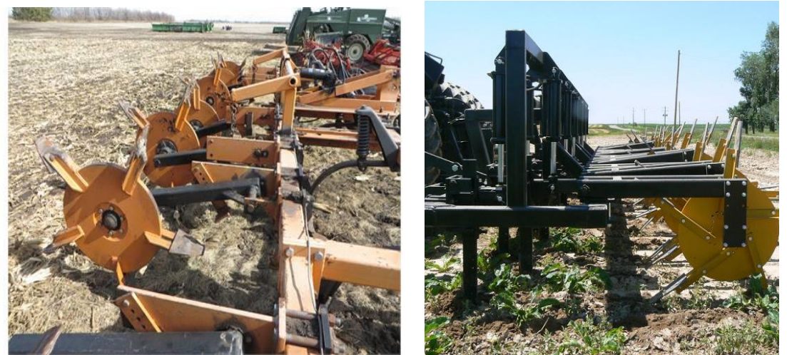
Fig.4. Dammer Diker equipment for storage tanks [16]

One type of storage tank is the Dammer type compartment, which uses blades (shovels) mounted in a wheel arrangement Fig.4, to make small tanks or tanks, Fig.5, [11]. Dammer Diker equipment is simple, but the effect is substantial. It greatly improves the access of each plant to moisture, nutrients, temperature and air.