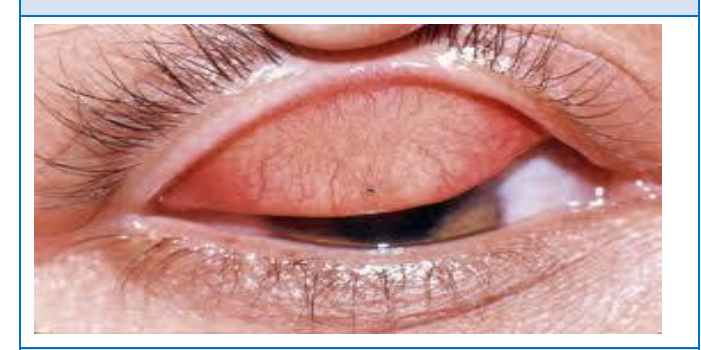
Superficial foreign body<sup>[15]</sup>