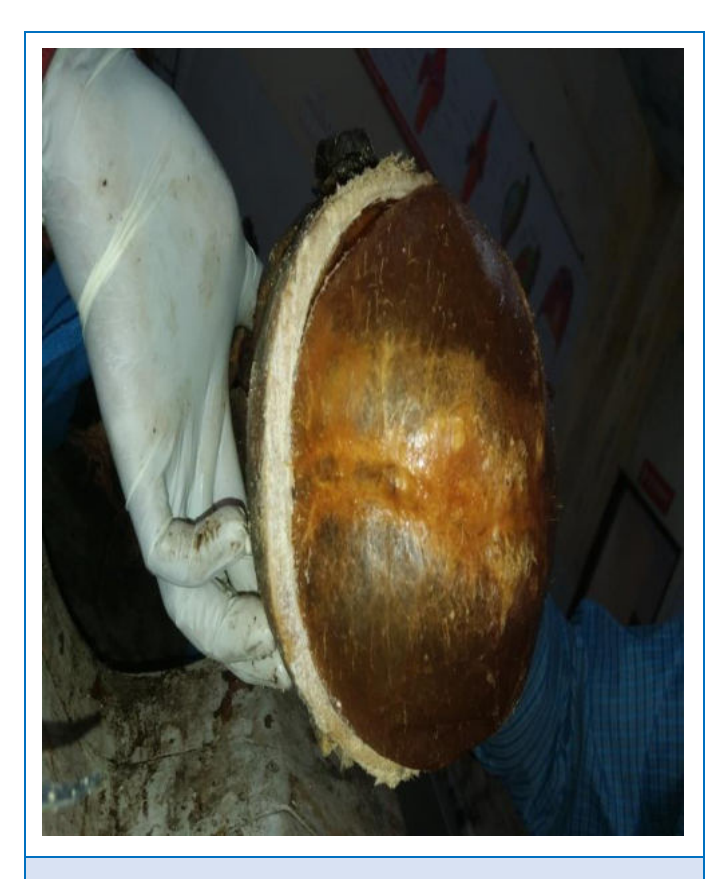
Photograph showing the duramater.

Photograph showing the nailing at the site of Utkshepa Marma