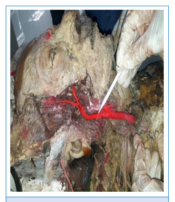
Coloured Photograph showing the maxillary artery and superficial temporal artery.