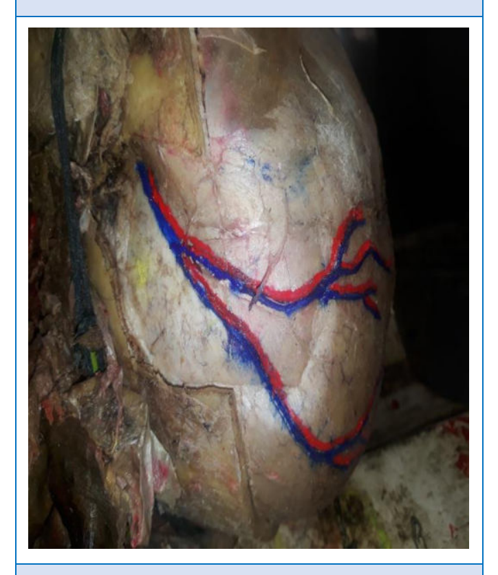
Coloured Photograph showing the middle meningeal vessels at the site of Utkshepa Marma .