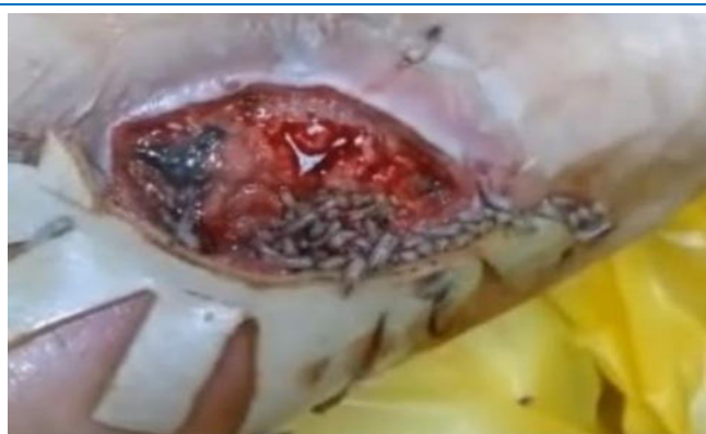
Loose form of larvae therapy