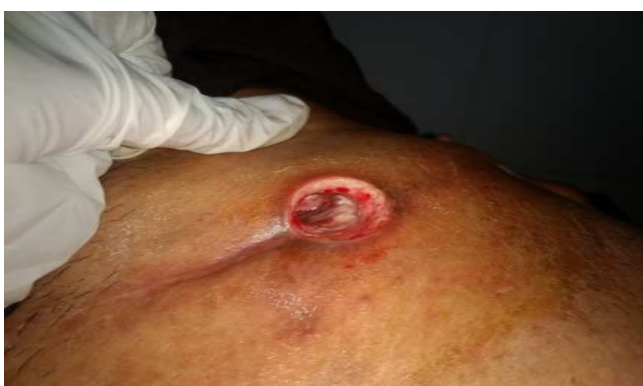
Fig. 6: Observation on 20-2-2018