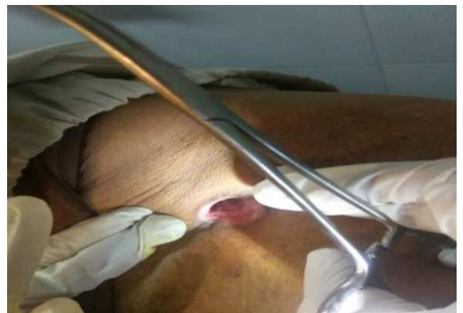
Fig. 2: Kshara Varti insertion