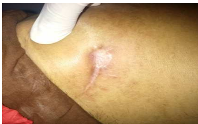
Fig. 7: Observation on 9-5-2018