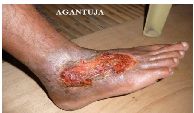
Agantuja Vrana Shopha

Aetiopathogenesis of Shopha is much resembled to inflammation. It is defined as local response of tissue to any kind of injury. Sushruta mentioned that Shopha occurs in sequential pattern, in six different stages called Shatkriyakala . [4] They are respectively as: