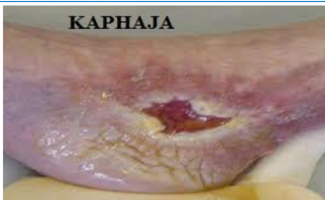
Kaphaja Vrana Shopha