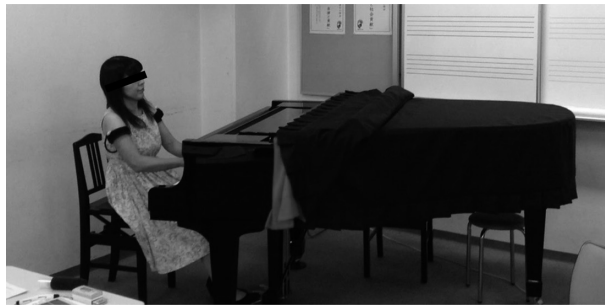
Fig. 1. Piano performance with blood flow restriction was performed while wearing pressure belts at the most proximal region of both arms.