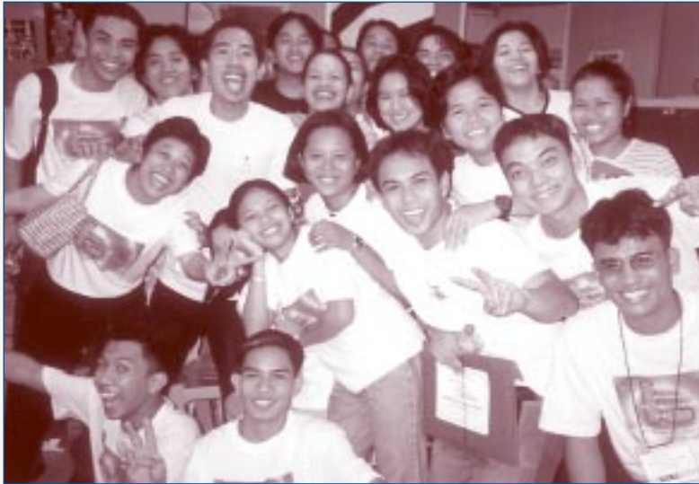
Efforts to improve the quality of reproductive health care for young people are more likely to succeed if young people themselves play an active role in developing innovations. Young adults in the Philippines helped develop a program to teach responsible behavior to their peers.

socioeconomic factors; and to provide unbiased care. At the same time, adolescents need to receive more specific information about fertility and contraceptives and how and where to obtain services at clinics and other venues.