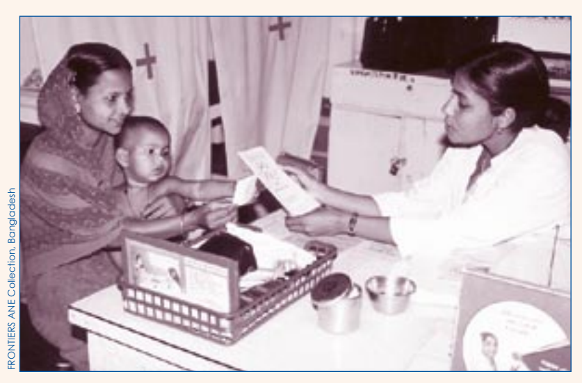
Managers should view the costs of providing high-quality care as investments in the future well-being of both clients and programs.

appropriate balance is best determined in the local context through dialogue among the key stakeholders: policymakers, providers, and clients.