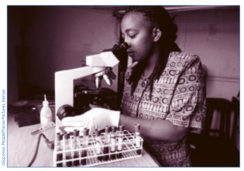
Sexually transmitted infections can have devastating consequences if not detected and treated. Providers should consider the risk profile and prevalence rates of their target population when determining how to allocate resources for STI services.

services because their estimates focus largely on the cost of supplies. An effective STI care model would also likely require training, supervision, education on prevention, and other types of support that could add to the cost of such services (RamaRao et al. 1996).