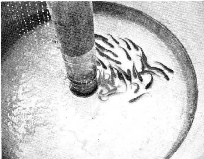
TILAPIA TANK UNIT