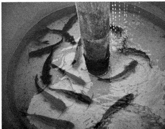
CATFISH TANK UNIT