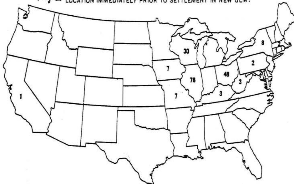
Fig. 2 LOCATION IMMEDIATELY PRIOR TO SETTLEMENT IN NEW ULM.