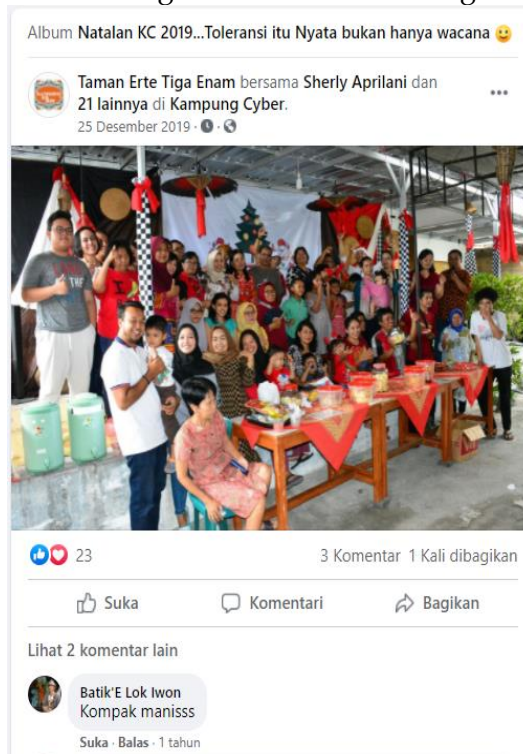
Picture 1. Interreligious celebration during Christmas

(Source: Facebook group Kampung Cyber, 2019)