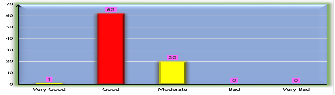
Graph 3. The Psychological Skills of Athletes

Based on table 4, it can be seen that 20 athletes have moderate category, 62 athletes have good category, and 1 athlete has very good category, and no athlete has bad or very bad category. The result of psychological skills of athletes are presented in graph 3.