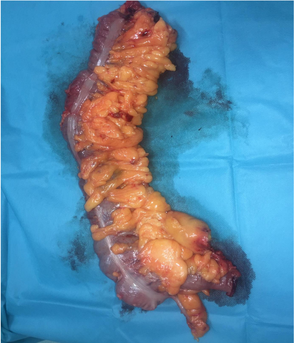
Figure 1: specimen of the hemicolectomy