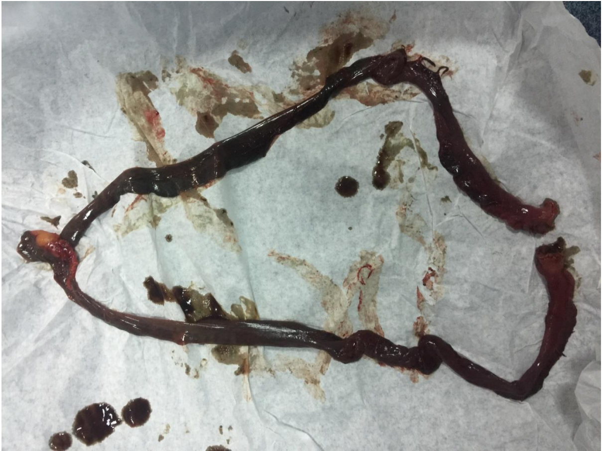
Figure 2: Post-operative image of the necrotized bowel