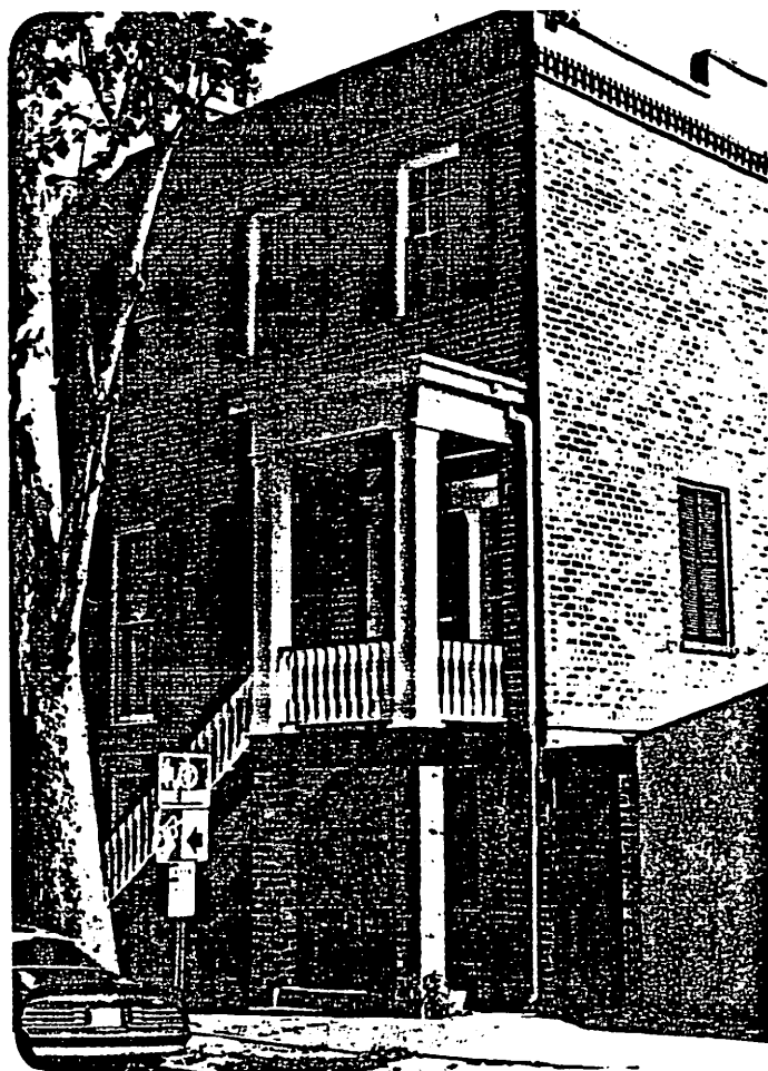
208 West Harris

HOUSES AT 208 AND 210 WEST HARRIS STREET, LOT 5 PULASKI WARD, BUILT BY ISAAC D. LaROCHE IN 1848 (210 WEST HARRIS) AND 1855 (208 WEST HARRIS)