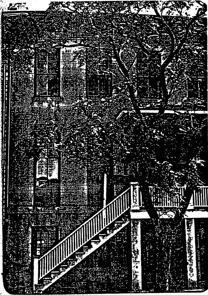
214 West Harris