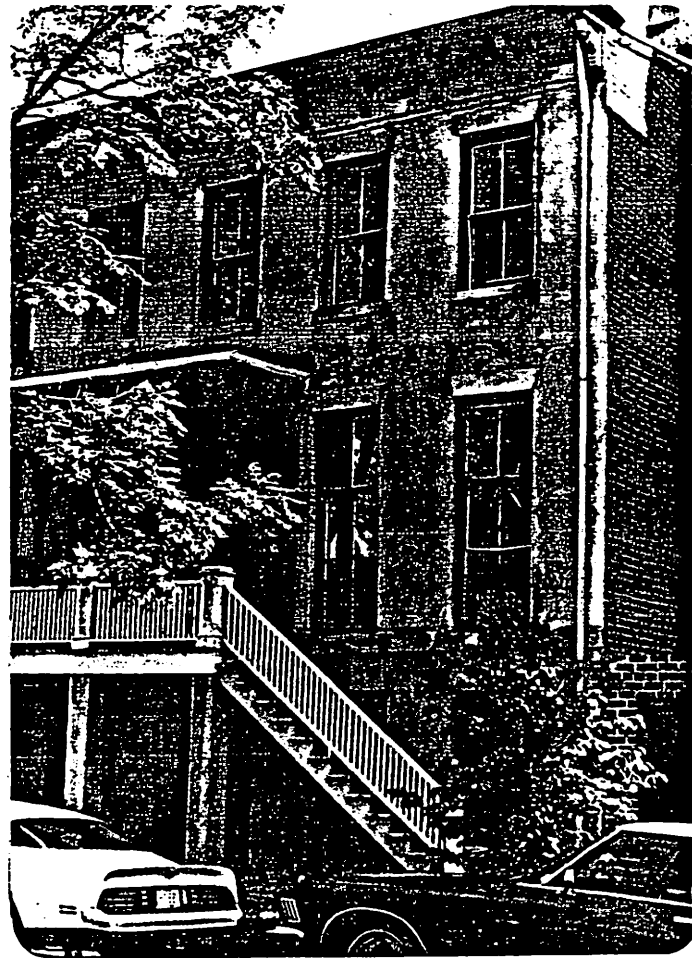
212 West Harris