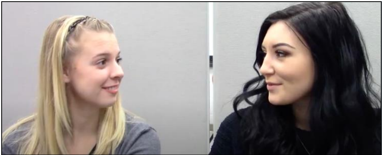
Figure 1.1 This photo exemplifies positive interactions while maintaining eye contact between two BGSU students.