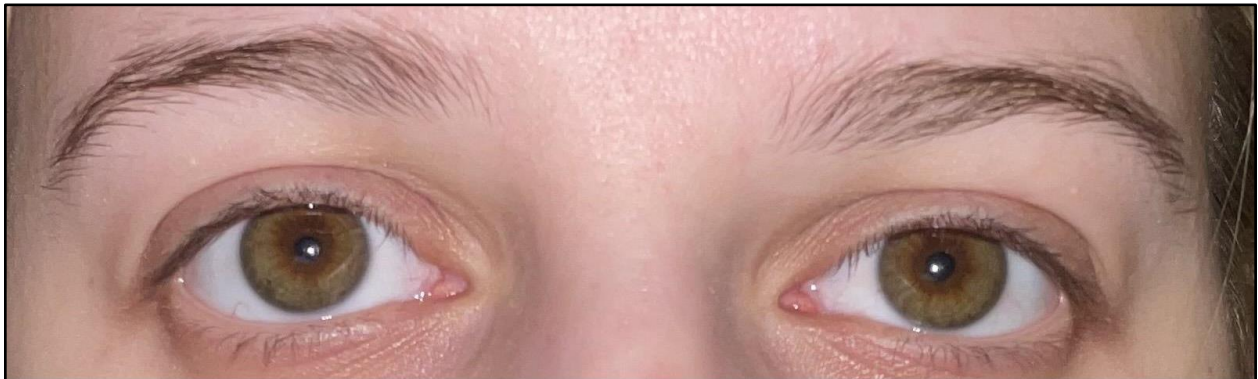
Figure 1.0 depicts a “dwell” or eyes fixated on a singular target