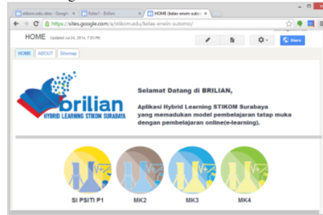
Fig. 1. Initial Display of Brilian

Each lecturer will find the most initial display of Brilian as illustrated in Figure 2.