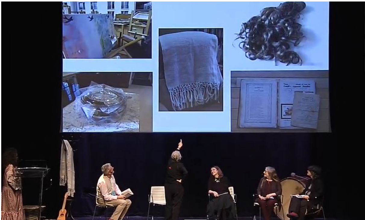
ILLUSTRATION 2.– Still image from the video of the closing event ( https://vimeo.com/362078953 ).