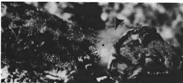
Figure 1 Freshly wounded Pachydactylus namaquensis from the Richtersveld National Park showing the extensive (but not exceptional) integumentary damage (arrows). The exposed areas remain covered by a thin portion of the lower dermis.

Pachydactylus namaquensis and P. bibronii were collected in rocky habitat at Anysberg Nature Reserve, Cape Province, South Africa (33°44'S / 20°27'E) on 19 October 1991. These specimens have been deposited in the collection