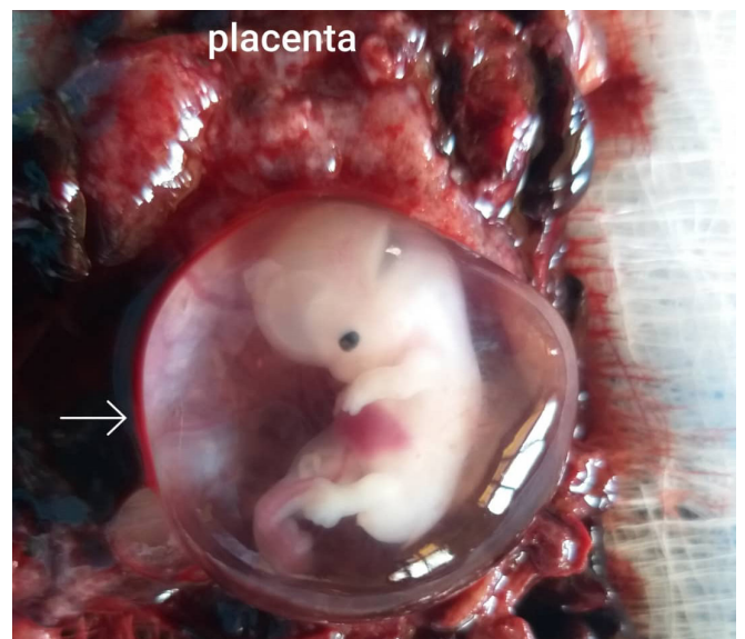
Figure 4. Amniotic sac (arrow), containing nine weeks foetus (after dissection of the excised right tubal ectopic pregnancy).

Usually, the management of heterotopic pregnancy is complicated requiring emergency surgery.<sup>[2, 3]</sup> Earlier diagnosis may minimize the need for surgical management as well as decrease the risk to the patient.<sup>[6]</sup> If early diagnosed, other options like medical management can be done to avoid surgery and its complications. Surgical management was the only option in this particular case (because of deranged vital signs, having extrauterine pregnancy with visible cardiac activity). Medical management is not feasible in South Sudan, however in some situations early recognition allows for possible medical management using a drug like methotrexate and the woman can attend early and be followed up to make sure she is no longer pregnant.