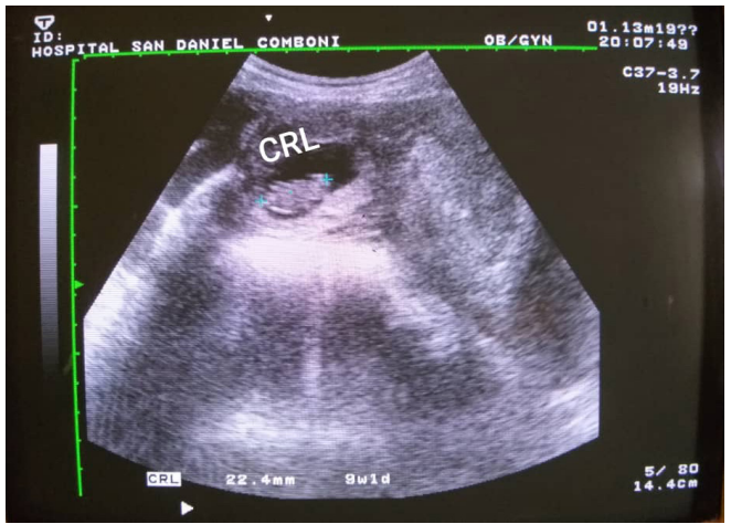
Figure 2. Transabdominal sonography showing ectopic pregnancy with Crown- rump Length (CRL) of 22.4 mm equivalent to nine weeks and one day.

With the diagnosis of heterotopic pregnancy, the patient was rushed to the operation theatre for emergency surgery and resuscitation was continued in theatre. Under general anaesthesia the abdomen was opened via an infra-umbilical midline incision. One litre of blood was drained from the abdomen. There was a right tubal pregnancy ( 6 \ge 4 \mod ) with active bleeding from the fimbrial end of the tube was seen (Figure 3). The contralateral fallopian tube and