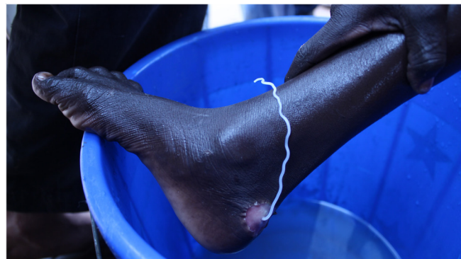
Figure 1. Guinea worm emerging from the foot of a patient in South Sudan

Despite a prolonged civil war, there was a 95% reduction in reported cases of GWD in South Sudan between 1995