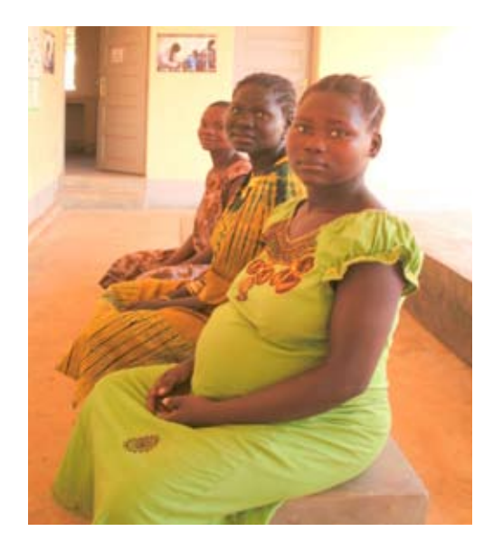
Figure 1. Ladies at the new ante-natal clinic

The position of the head can adversely affect the progress of labour. If it is tilted (asynclitic) or erect instead of flexed (this is sometimes called military!) the head will not stimulate regular effective contractions. During training midwives should learn all the possible positions of the head and how to feel for them.