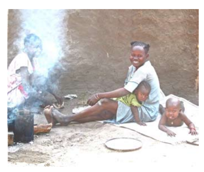
Figure 2. Inhalation of smoke from biomass fuel may cause respiratory disease in adults and children.

• Allergens may be an important cause of asthma. In 2003 locusts were associated with 11 deaths and 1600 hospital visits in central Sudan. Asthma and rhinitis in Sudan has also been associated with exposure to airborne allergen from the "green nimitti" midge Cladotanytarsus lewisi. Urbanisation is associated with an increase in exposure to indoor allergens such as the house dust mite or pet dander (2), and increased air pollution increases sensitisation to allergens.