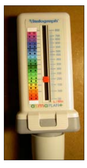
Figures 1a and b. Example of a colour coded peak flow meter and chart for home use by illiterate patients.

taking. Lack of funds, fear of side effects or lack of understanding of the need to take regular medication may result in the patient taking a much lower dose of drug than that prescribed, or stopping the medication when the symptoms resolve. It is important to: