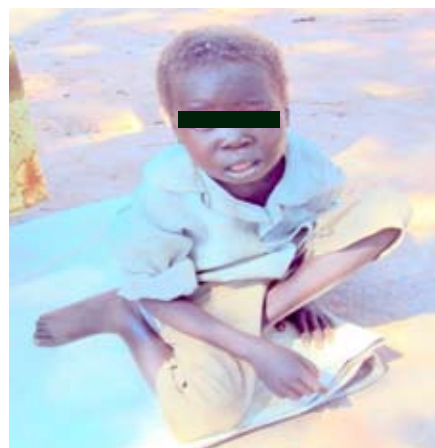
Figure 1. A 15-year old boy with stunting and mental retardation in Witto Payam

We asked individuals to give a history of the syndrome