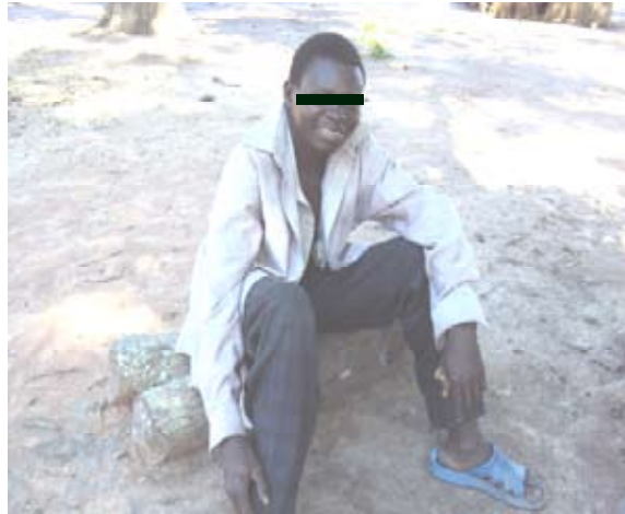
Figure 2. Mental retardation in the young adult in Witto Payam

Figures 1 and 2 show some affected children.