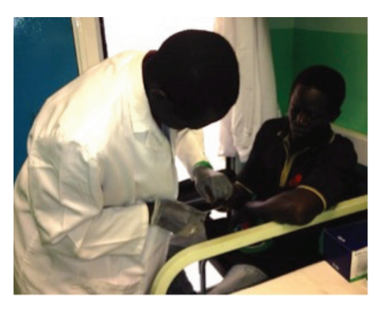
Figure 3. A venepuncture sample being obtained from a clinic attendee

The quantification of HBV-DNA is important for patient monitoring and helps determine the necessity of treatment, with elevated viraemia being a surrogate marker for poor disease outcomes such as cirrhosis and HCC [12].