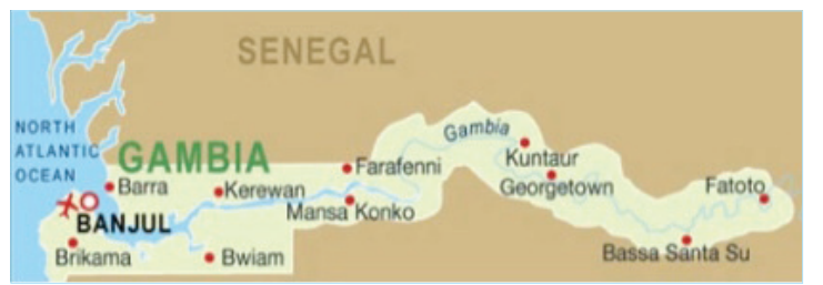
Figure 2. Map of The Gambia

West Africa and in particular, The Gambia, where it is present in over 90% of chronic carriers [10]. The clinical impact of this is yet to be elucidated.