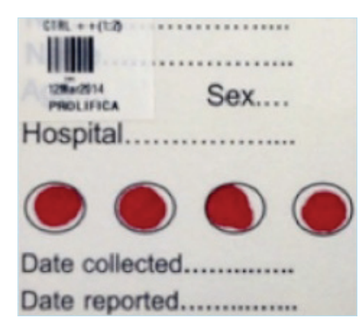
Figure 4. A filled Dried Blood Spot card