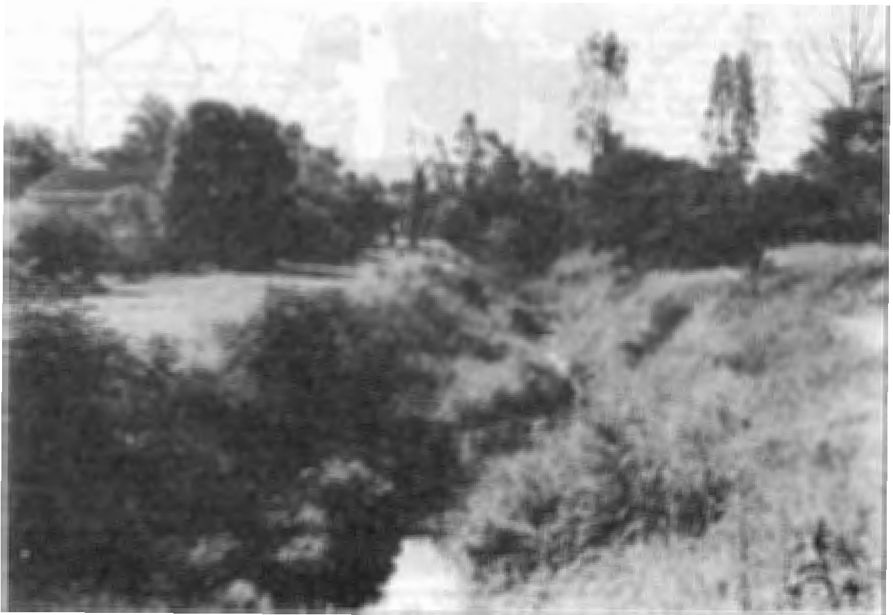
FIGURE 2 A section of the Foxhill Spruit in the Pelham area showing the proximity of houses to the river.

The MCCG began by meeting with the Pietermaritzburg Parks and Recreation Department. This led to many interviews and meetings with other interested parties, including local environmentalists, city councillors, the Natal Parks Board, the Wildlife Society of Southern Africa and the Scottsville Ratepayers Association. At these meetings the