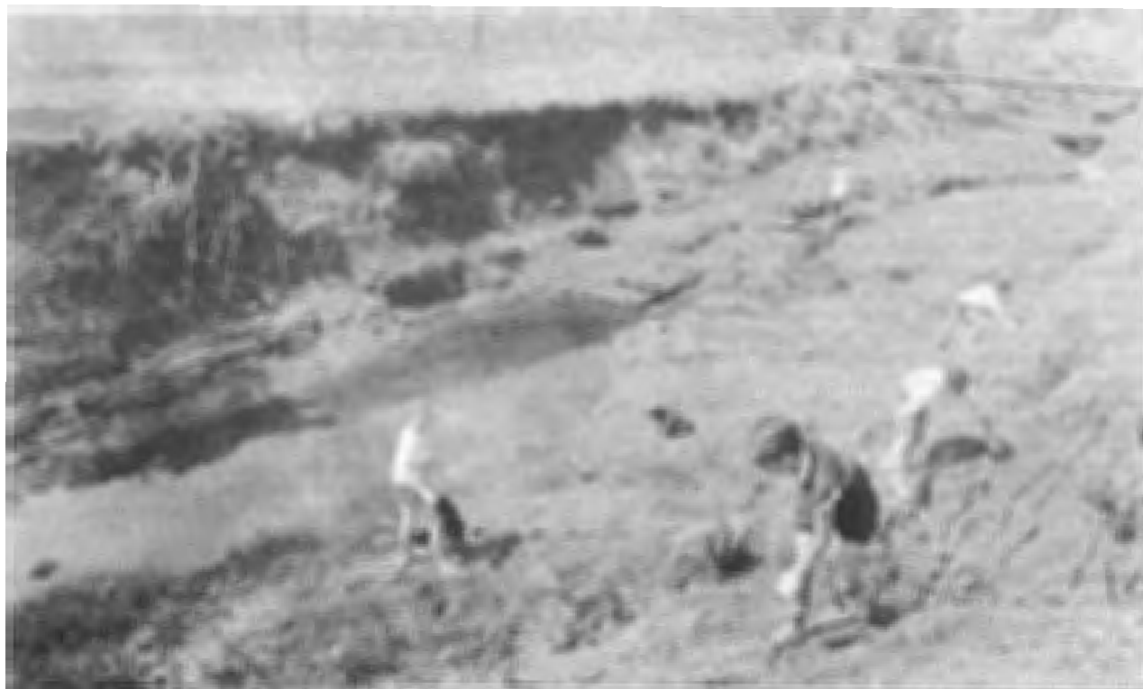
FIGURE 3 Pupils of Alexandra High School collecting litter along a section of the Foxhill Spruit near the school.

The acquisition of sufficient numbers of seedlings is in itself a large undertaking. For